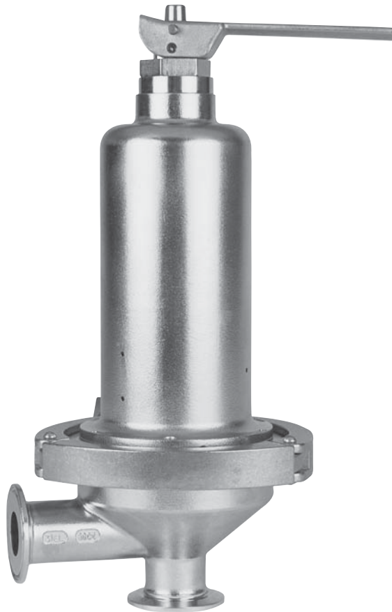
1" MODEL C-BPV with Investment Body (pictured with hex adjustment nut)

The Model C-BPV* is a 316L SST self-contained back pressure/relief regulator designed for liquid or gaseous fluids utilized in sanitary biotechnological process piping systems. The unit is capable of controlling inlet pressure to setpoint levels between 2-125 psig (.14-8.6 Barg).